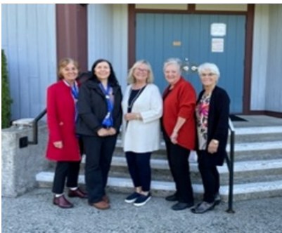
League Development Day, October 11 Parksville