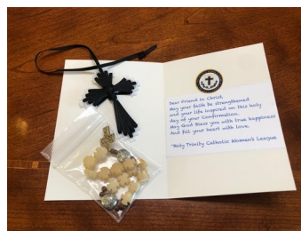
First Communion May HTCWL gave beautiful hand-made gifts to the children.