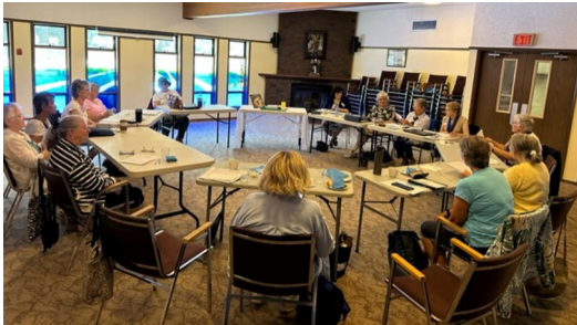
Hosting Diocesan Planning Meeting July