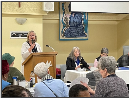
Diocesan League Development Day, March 25 at St. Edward the Confessor Church, Duncan