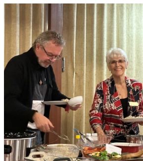
Christmas Potluck December 9