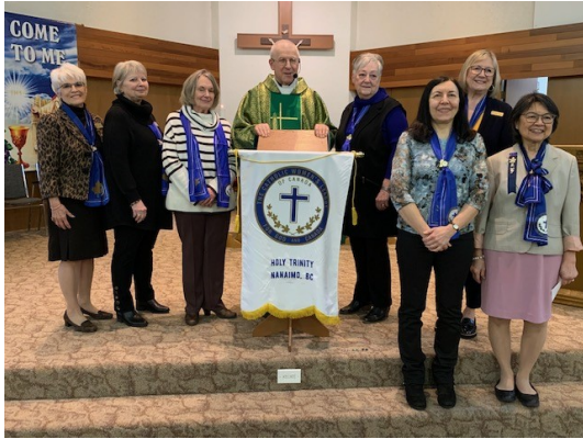
Installation of new HTCWL Executive February 5