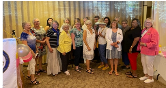
Presentation of Pins at the Tea