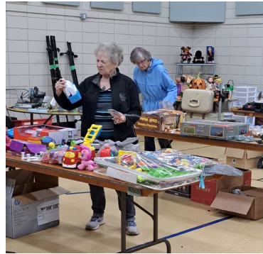
Helping at the Knights' Garage Sale September