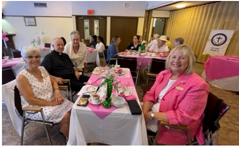
Strawberry Tea June