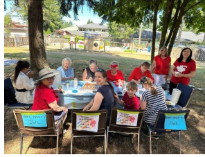
Year in Review Rock Painting July 1 at the Parish Picnic