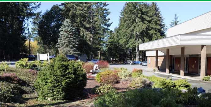
Holy Trinity garden and church After cleanup by Knights