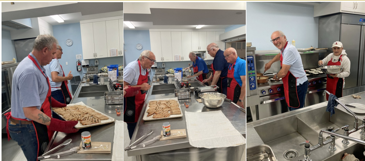
Council 9990 Pancake Breakfast: Served by Our council's Heroes

A friend emails you and asks for help buying a gift card for a family member or dear friend and can't access the site to make the purchase and asks if you can do it for him. Asks you to email this friend or relative and they will reimburse you.