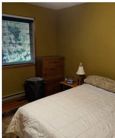
Painted Rectory bedroom