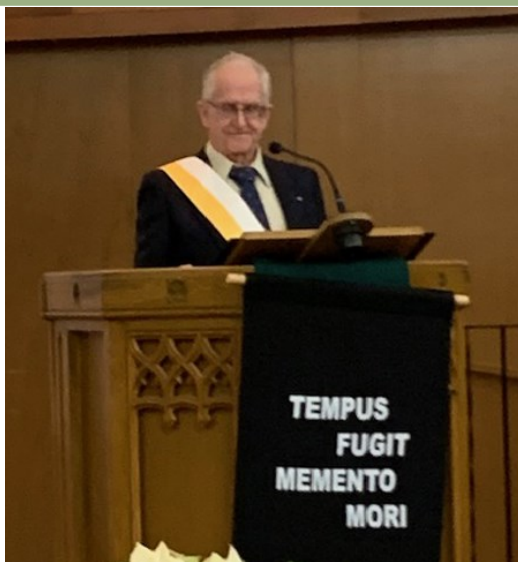
Exemplification Jan 27. 2024