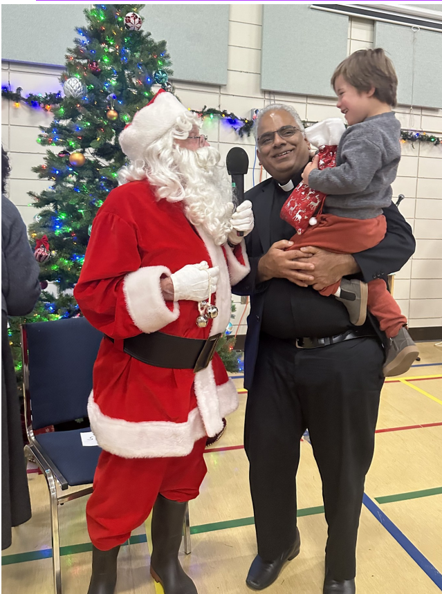
Christmas Dinner 2025