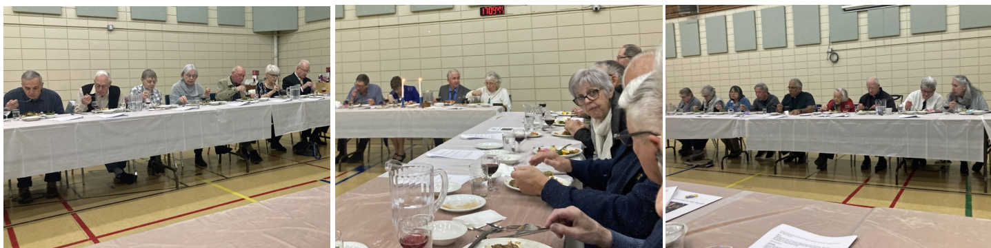
Seder Dinner March 31, 2026

Today , I interviewed my grandmother for part of a research paper I'm working on in my psychology class. When I asked her to define success in her own words, she said; "Success is when you look back at your life and the memories make you smile". Today , after my 72-hour shift at the fire station, a woman ran up to me at the grocery store and gave me a hug. When I tensed up, she realized I didn't recognize her. She let go all with tears of joy in her eyes and the most sincere smile and said; "On 9-11-2001, you carried me out of the World Trade Center."